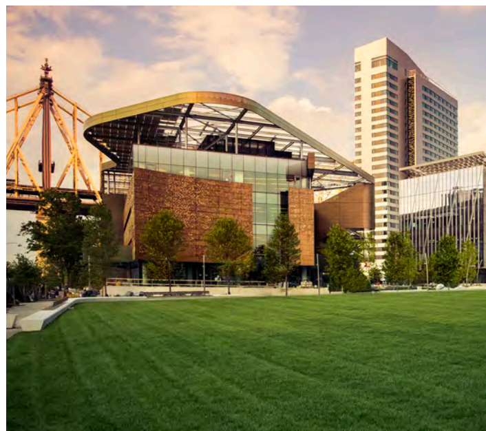
Cornell Tech Campus