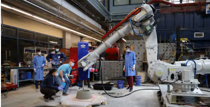
IRB 6650S Industrial Robot System in the Bovay Lab